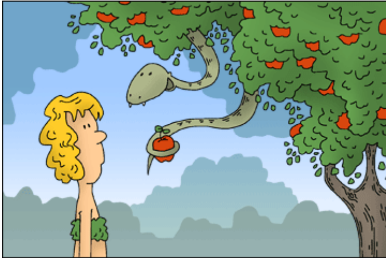
(See Genesis 3)